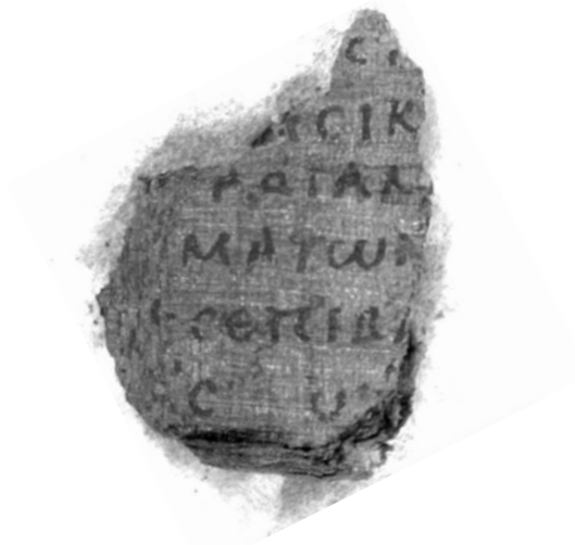
Photograph of PHerc 51, Cr. 4, Fr. 48.

PHerc 51, Cr. 4, Fr. 48 (approximately 19 x 28 mm) was selected for its combination of clear text, clean surface, sturdy construction, and ideal size for imaging.