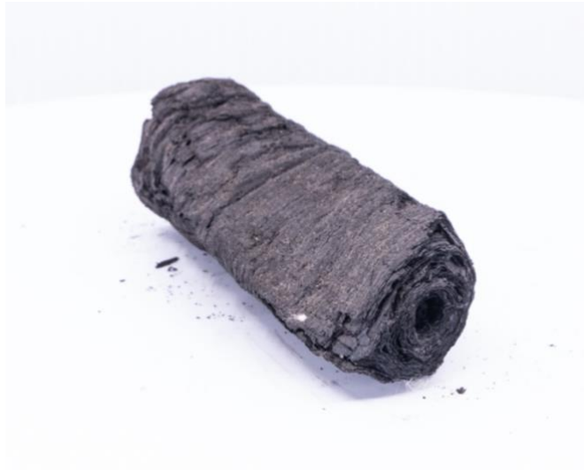
Photograph of PHerc 332.

PHerc 332 is an intact scroll part with approximate diameter 26 mm and length 77 mm.