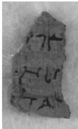
Photograph of PHerc 1667, Cr. 1, Fr. 3.

PHerc 1667, Cr. 1, Fr. 3 is a fragment from the unrolling efforts of PHerc 1667 (above). The fragment measures approximately 14 x 23 mm. This was chosen for imaging as it is a very rare example of suitable fragment and intact scroll part from the same original scroll (most likely). The physical unrolling efforts result in many cornici (trays) of many fragments each, so the naming means: Papyrus Herculaneum 1667, cornice (tray) 1, fragment 3.