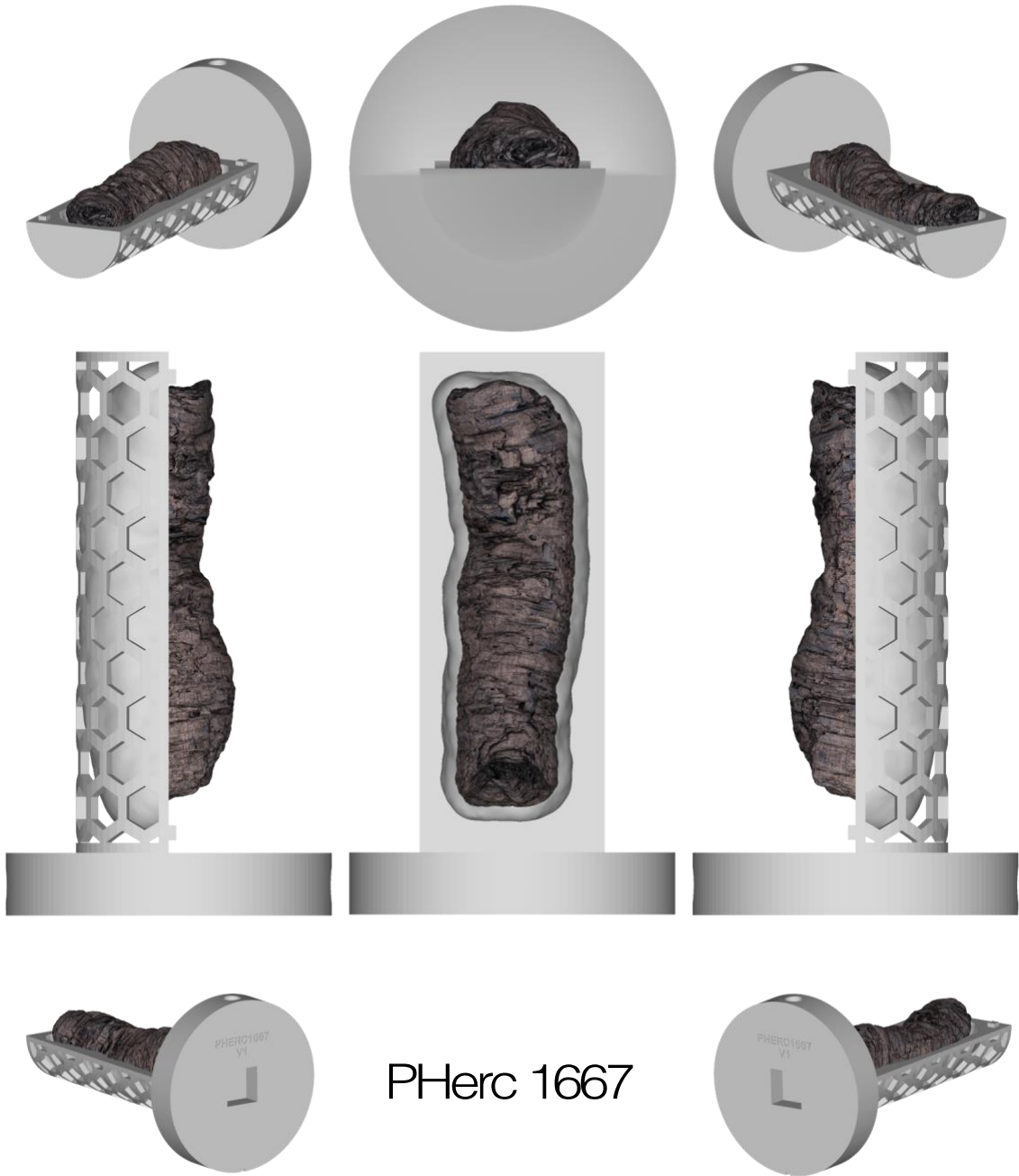
Renders of 3D models for PHerc 1667 and its case.