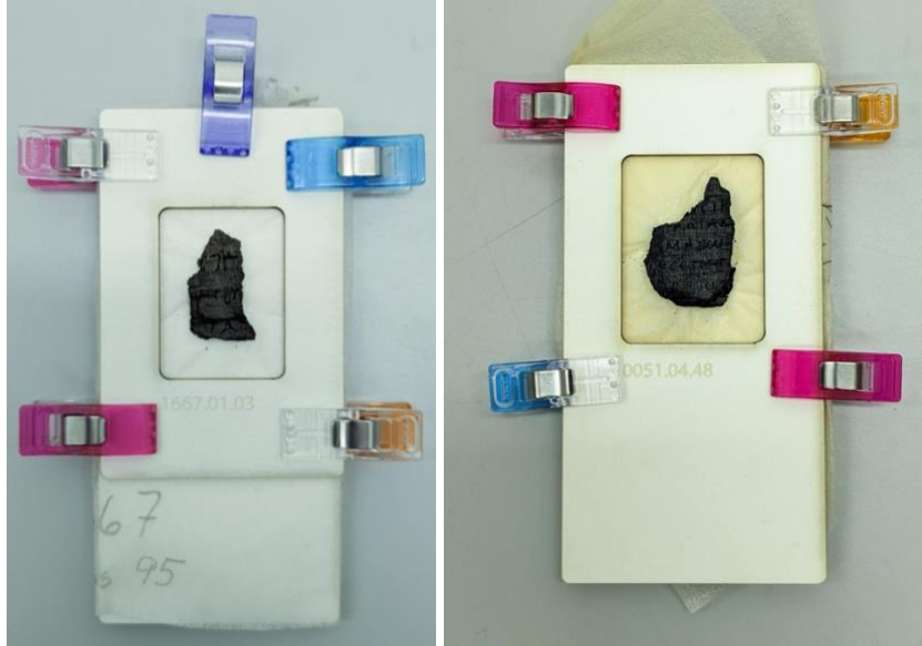
PHerc 1667, Cr. 1, Fr. 3 (left) and PHerc 51, Cr. 4, Fr. 48 (right) fixtured for scanning.