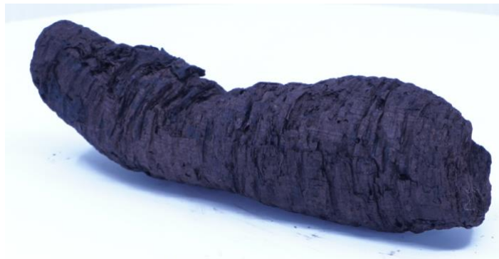
Photograph of PHerc 1667.

PHerc 1667 is an intact scroll part with approximate diameter 30 mm and length 85 mm.